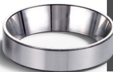
Superfinished raceway mirror effect